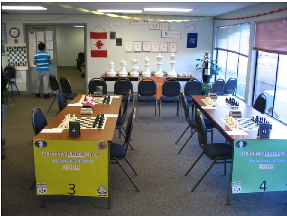
The Tournament Hall before the action started